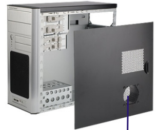
Chassis Air Guide V1.1 (compatible with 8cm fan)